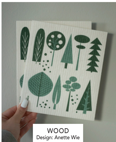
WOOD Design: Anette Wie