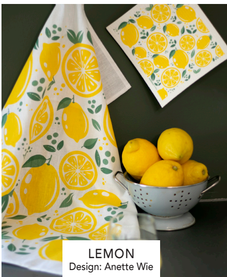
LEMON Design: Anette Wie

See all designs and products at www.designparken.com